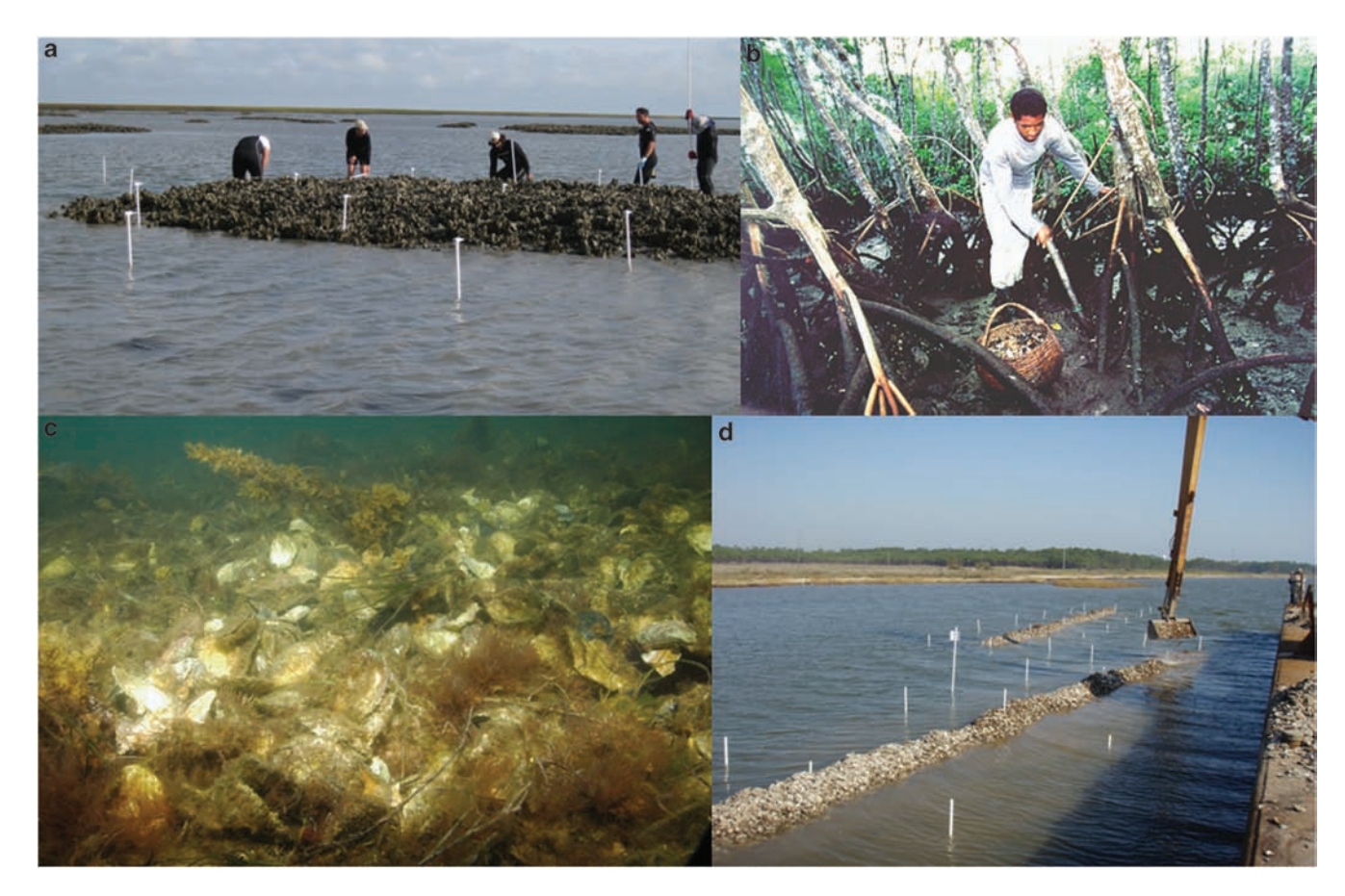
Figure 3. Oyster ecosystem services. (a) Light sensors deployed at low tide to measure filtration and changes in water clarity over a restored oyster reef in Virginia. (b) Oysters being gathered in a mangrove forest in Brazil. (c) Oyster reef restoration in progress to measure shoreline protection in Alabama. (d) Habitat provided by the Australian flat oyster in Tasmania, Australia.

and sport fisheries (e.g., Lipton 2004). Although there is increasing recognition that shellfish provide multiple ecosystem services, management for objectives beyond harvest has not yet become widespread.